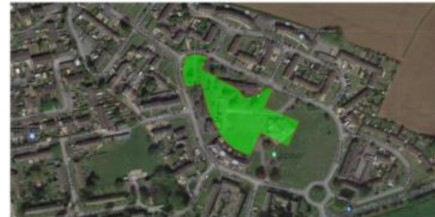
GreenSquare's proposed 'green': 0.66 hectares/1.67 acres

Current green space: The Green: 0.63 hectares/1.56 acres Other green spaces: by entrance to Community Centre: 0.08 hectares/0.2 acres around Club Row: 0.13 hectares/0.33 acres at 'top end' of Westwood/Leylands: 0.05 hectares/0.13 acres Total current green space: 0.89 hectares or 2.22 acres